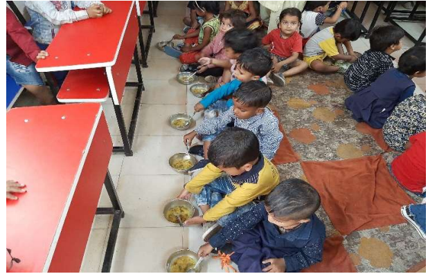
Basti Vikas Kendra, Srinivaspuri