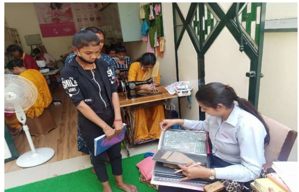
Skill Development Centre